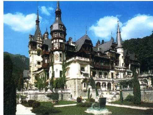
Peles Castle →

Day 7 - breakfast , sightseeing tour, continue to Bran - visit of the castle and lunch, drive to Sinaia - visit Peles castle, dinner and accommodation at New Montana/Sinaia- 4 *.