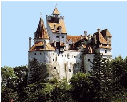
← Dracula's Castle

Day 6 - breakfast, drive to Piatra Neamt, on the way visit of Neamt monastery, continue via Bicaz Gorges to Lacu Rosu -lunch. Drive via Miercurea Ciuc - Sf Gheorghe to Brasov, dinner and accommodation at a 4- 5* hotel in Brasov.