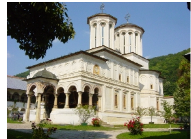
Horezu Monastery built in 1690 →

Day 2 - breakfast, drive to Pitesti- Ramnicu Valcea to Horezu – visit the monastery, continue to Cozia - visit monasteries Cozia, Turnu, Stanisoara - Lunch. Continue to Sibiu, dinner and accommodation at a 4* hotel.