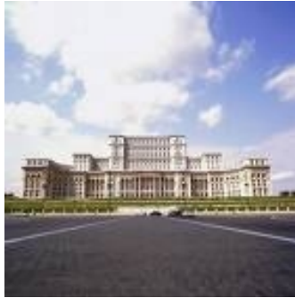
← People's Palace

Day 1 - arrival in Bucharest, panoramic sightseeing tour, folklore dinner, accommodation at a 4 -5* hotel.