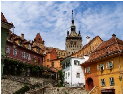
← Sighisoara Medieval city in Transylvania

Day 2 - breakfast, drive to Pitesti- Ramnicu Valcea to Horezu – visit the monastery, continue to Cozia - visit monasteries Cozia, Turnu, Stanisoara - Lunch. Continue to Sibiu, dinner and accommodation at a 4* hotel.