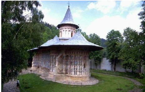
← Voronet Monastery

Day 5 - breakfast, visit monasteries Voronet and Humor, continue to Suceava - lunch , then visit Dragomirna monastery. Return to Gura Humorului for dinner and accommodation.