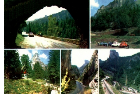
Bicaz Gorges →

Day 6 - breakfast, drive to Piatra Neamt, on the way visit of Neamt monastery, continue via Bicaz Gorges to Lacu Rosu -lunch. Drive via Miercurea Ciuc - Sf Gheorghe to Brasov, dinner and accommodation at a 4- 5* hotel in Brasov.